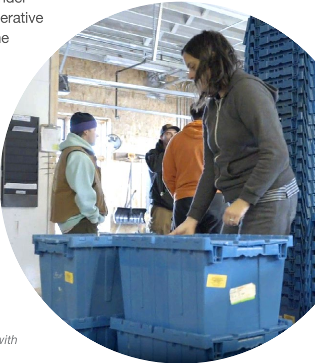
PHOTO: Western Montana Growers Cooperative staff pack veggie boxes with locally sourced food from their 40+ producer-members

310 : Cooperative jobs were created or saved over the past year