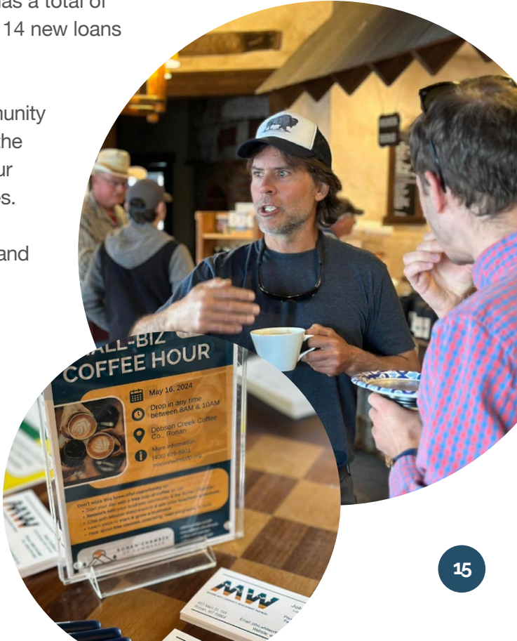
PHOTOS: Mission West staff meet with business owners at a ‘Coffee Hour’ in Ronan

Workshops: Mission West facilitates small business workshops designed to provide local entrepreneurs with the resources they need to develop, sustain, and grow their business. In the last year, MWCDP facilitated 21 workshops that 99 people attended